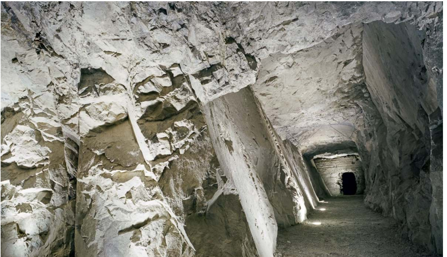
Chemollo, © Chemollo