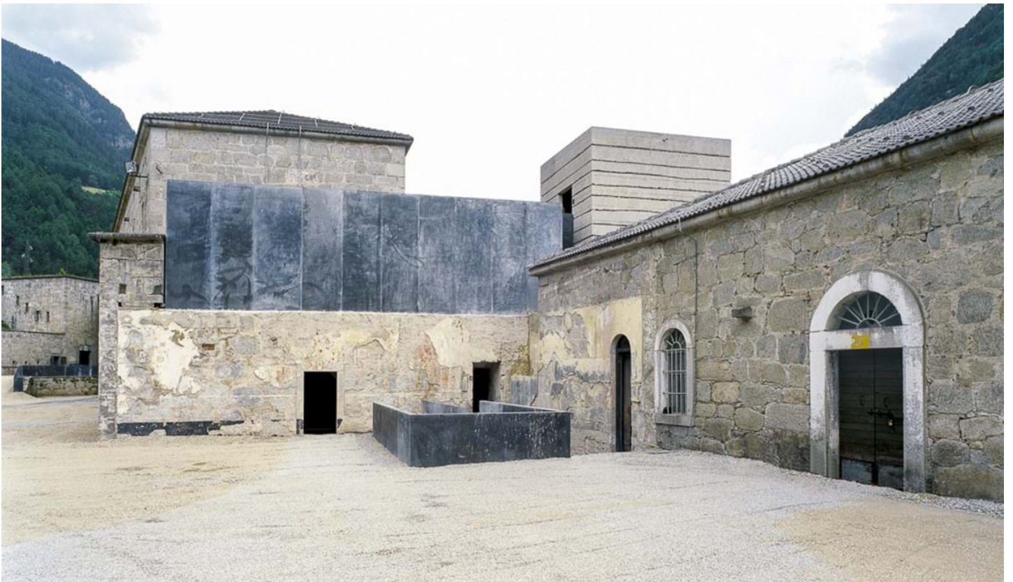
Renä Riller, © Renä Riller