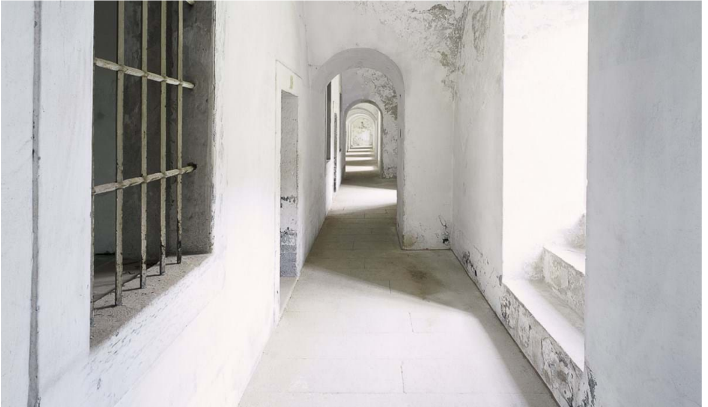
Renä Riller, © Renä Riller