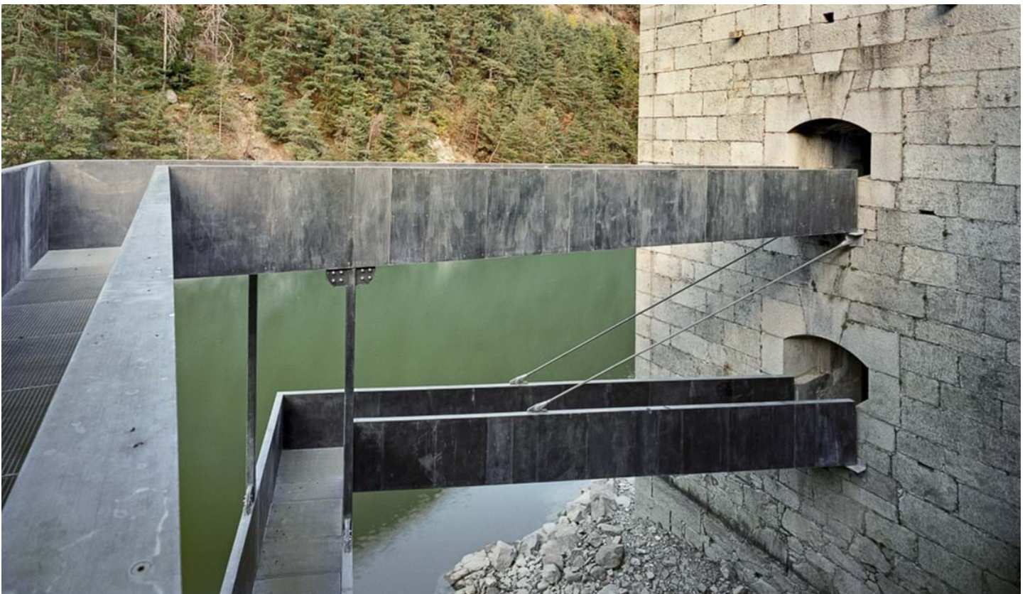
Chemollo, © Chemollo